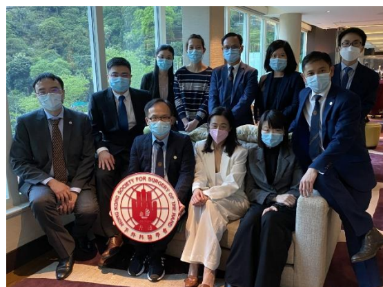
The HKSSH council Members and the 33 rd HKSSH Annual congress Organizing Committee members