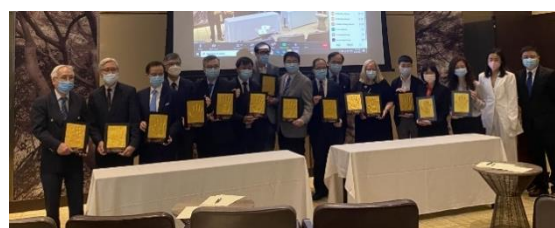
The Hand-Print Ceremony of our past presidents to celebrate the 35 th anniversary of HKSSH